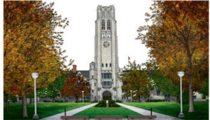
The University of Toledo, Toledo, Oh

We are certainly used to seeing the Mainstream Media causing trouble for conservatives and this one is no different at least on that level. But the interesting thing here is that the trouble a social conservative discovered was as a result of what she wrote in the MSM as opposed to what was written about her by the MSM.