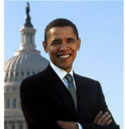
Sen. Barack Obama

Campaign Speech: My father was a poor Kenyon goat herder who was brought to America to attend college under a John Kennedy education program. Fact: Barack Hussein Obama Sr. was wealthy by African standards, spoke fluent English, excelled in academia and was already a graduate student at the University of Hawaii when he met and married Barack' mother before Kennedy was elected. He eventually went to Harvard University.