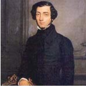
Alexis de Tocqueville

The great French analyst of American democracy, Alexis de Tocqueville, warned us this would happen almost two centuries ago: