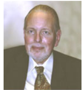
Paul M. Weyrich