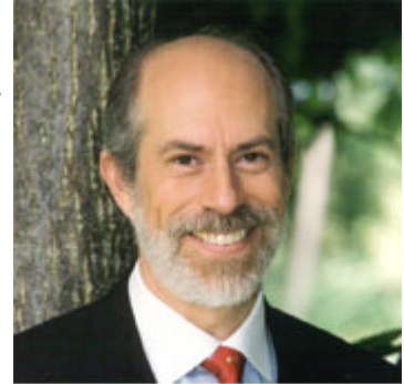
Frank J Gaffney Jr.

Sadly, being party to the Law of the Sea Treaty is not going to keep our foes from using it against us. Like those of virtually every other international organization, LOST's institutions (executive, legislative and judicial, if you please) are rigged-games. The United States will be routinely outvoted or otherwise unable to prevent infringements on its sovereignty and, yes, in all likelihood over time even its military operations.